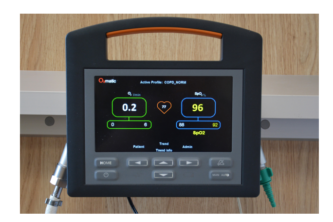
Figure I The O2matic® device.

The O2matic oxygen controller is a closed-loop system that, based on continuous monitoring of pulse and SpO<sub>2</sub> by a standard wired pulse oximeter, adjusts oxygen flow to